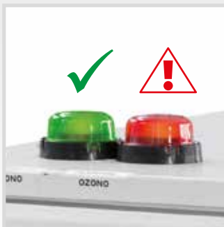
CONTROL OF THE SPRAYING WATER POTENTIAL WITH ALARM SYSTEM