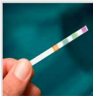
COLORIMETRIC KIT FOR THE CONTROL OF OZONE CONCENTRATION