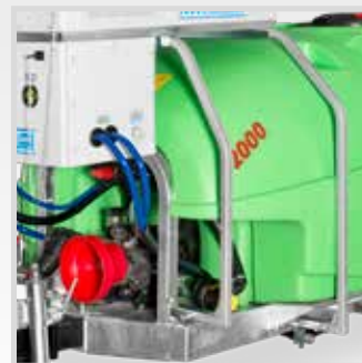
MOUNTING KIT FOR MIST BLOWERS