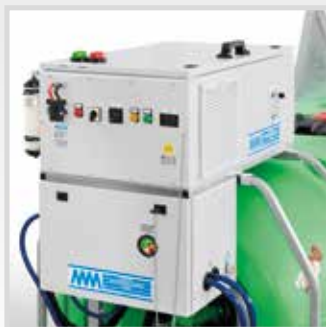
OZONATOR WITH AUTOMATIC AND AJUSTABLE MIXING SYSTEM

MM-BIOZONE IS THE PATENTED KIT FOR OZONISATION COMPOSED OF: